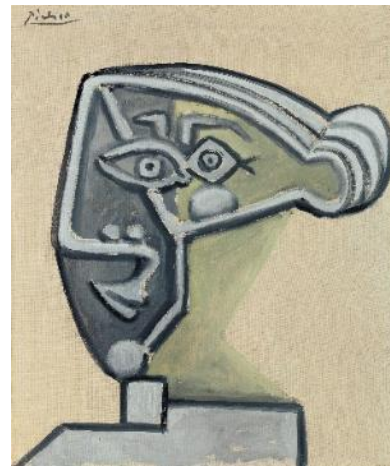
Left: Pablo Picasso, Le Compotier , Ripolin on paper laid down on canvas, 1946, estimate: $1.4 -1.8 million; Right: Picasso, Tête de femme , oil on canvas, 1952, estimate: $2.5 – 4.5 million

New York - Christie's 20 th Century Art sales in November will feature a selection of Modern and Contemporary works of art from The Israel Museum, Jerusalem, sold to benefit the acquisitions fund. Over 100 works will be offered in live and online auctions at Christie's across the week of November 9-16, 2018, including sculptures, paintings, and works on paper by Pablo Picasso , Jean Arp , Raoul Dufy , Georges Braque , Piet Mondrian , Henry Moore , and Victor Vasarely among others. All proceeds from the sales will be invested back in the Israel Museum's Acquisitions Fund and will support strategic additions that will strengthen and enhance the diversity and scope of the institution's collection of Modern Art.